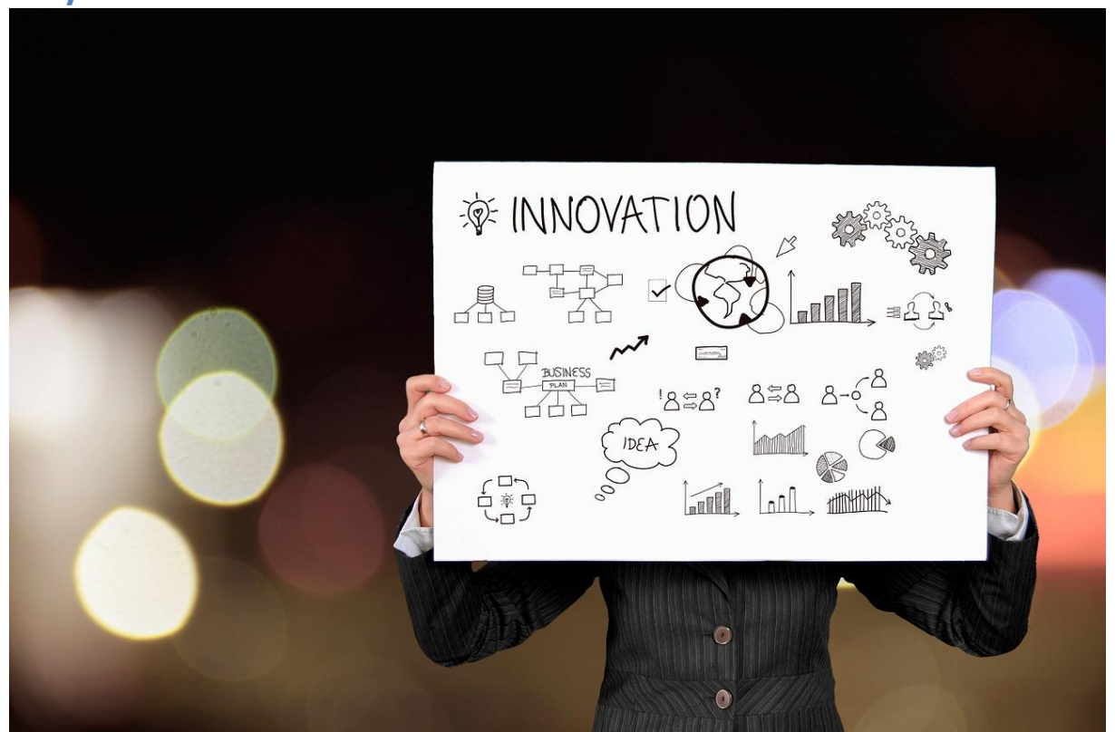
Picture under creative commons licence. © by Michal Jarmoluk @ pixabay.com